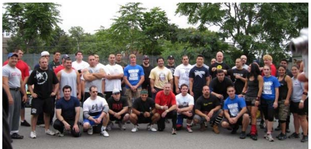
NYC's Strongest Man Competitors